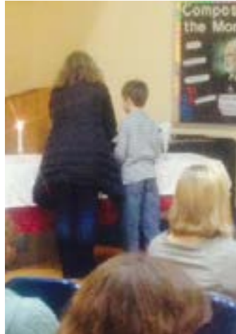
A Drew's Hope family lights a candle of remembrance in honor of their loved one.

Families are divided into the age groups: adults, adolescents, and kids. Each group participates in meaningful discussion and creative activities to help in their grieving process.